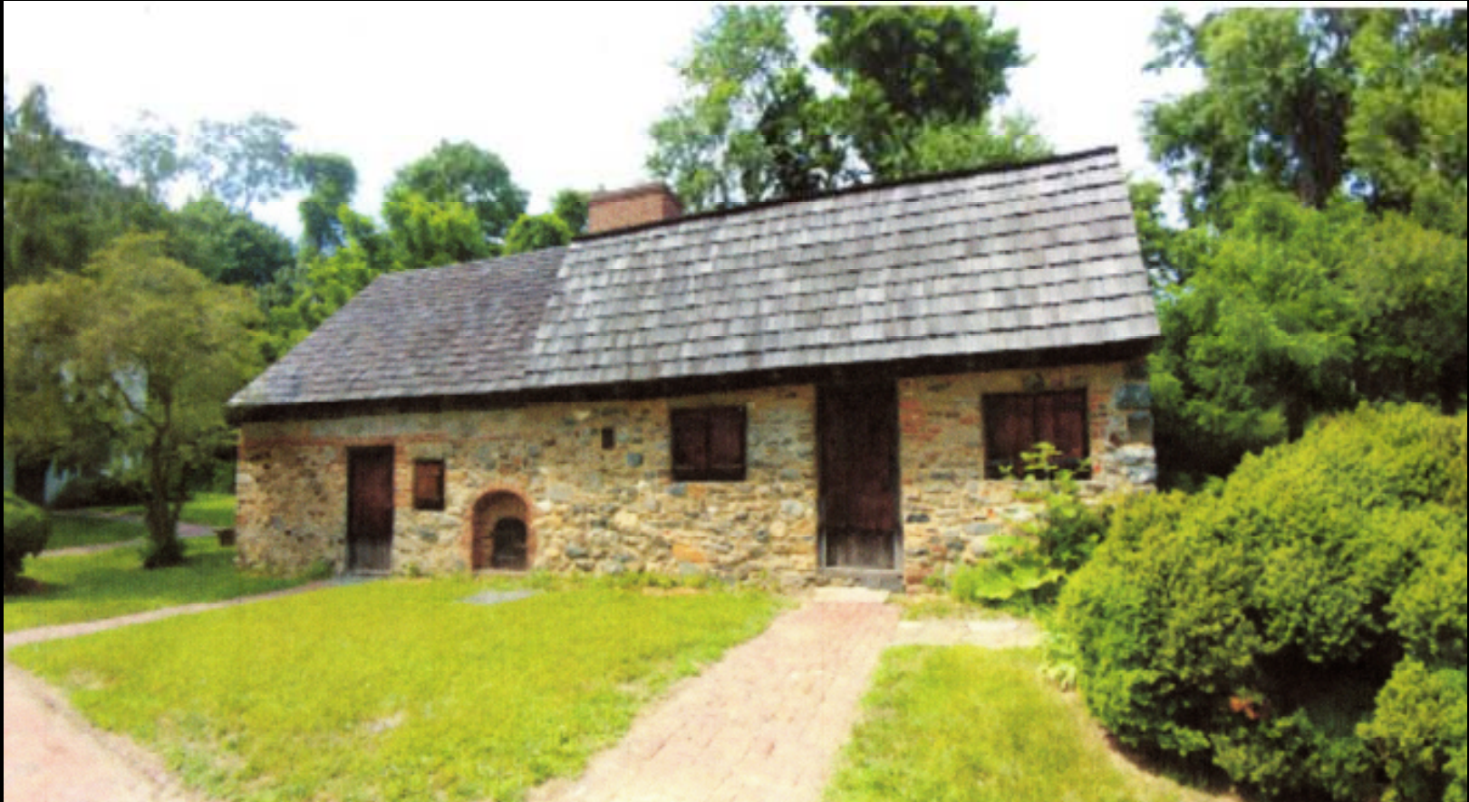
The Pusey House